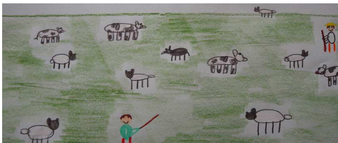
Urbański Lukas class III