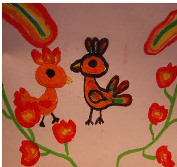
Irmina Leszczyńska klasa III

99-400 Łowicz, Maurzyce tel.+48 046 838 81 20