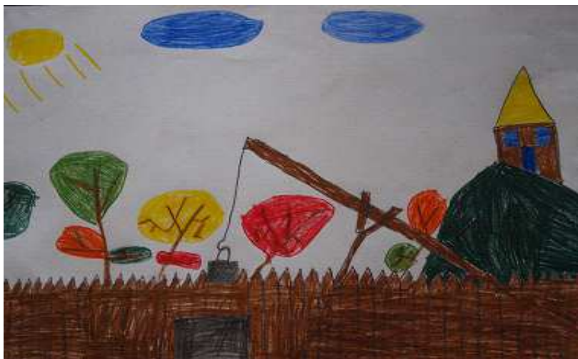
Kamil Jugowicz class III